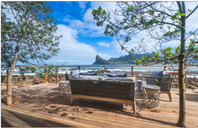
Main Expanded Deck